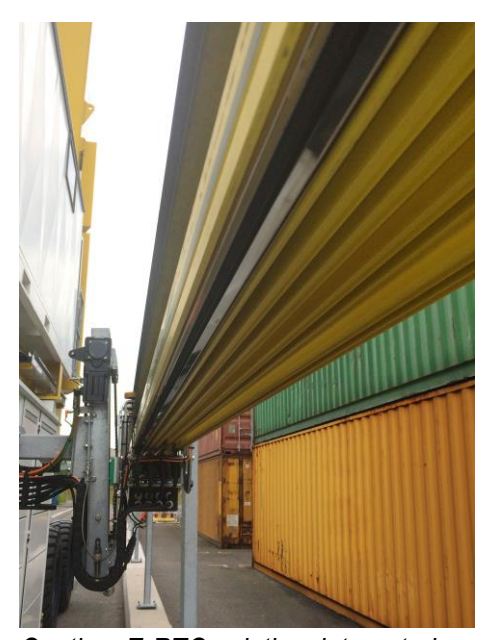
Caption: E-RTG solution: integrated energy and data transmission system ProfiDAT® with PE

Caption: ProfiDAT® data transmission by Conductix-Wampfler is installed in parallel to the existing conductor rails on STS container cranes, or can also be installed in the PE as an integrated solution. The ProfiDAT® antenna moves inside the profile and is in contact with the transceiver via an Ethernet interface.